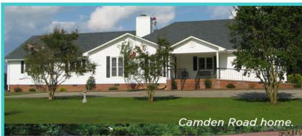
Camden Road home.