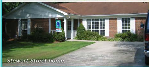
Stewart Street home.

InReach is pleased to announce the addition of two group homes in Wingate, N.C., effective July 1, due to the acquisition of Union County Residential Services (UCRS). We are thrilled to be providing group home services to 12 residents in two beautiful homes – one on Camden Road and one on Stewart Street.