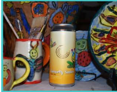
Butterfly Smiles Pale Ale can and artwork.