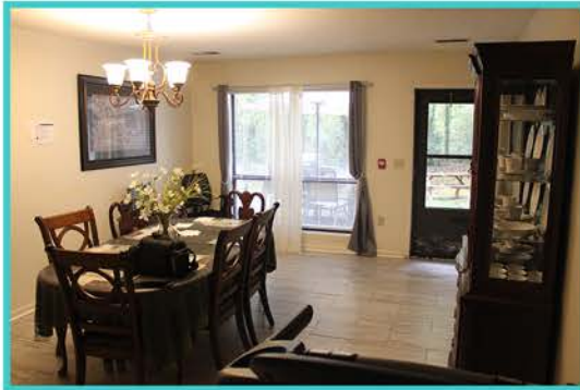
Dining room after makeover.