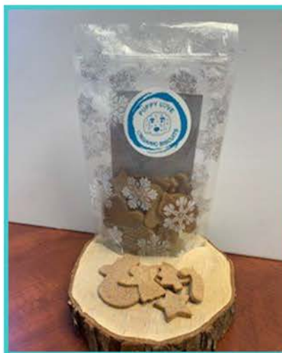
Organic Dog Biscuits.