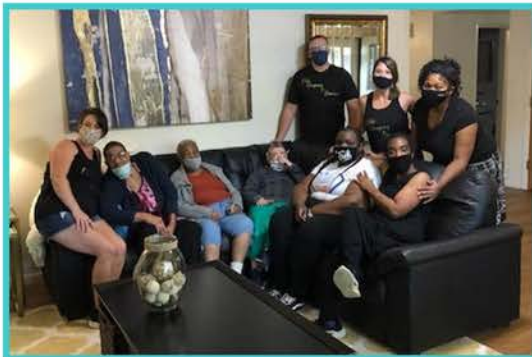
Elite Staging and Design team with ladies of Williams Road Residence.