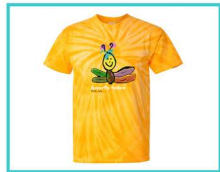
Butterfly Smiles T-shirt.