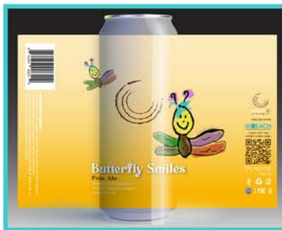
Butterfly Smiles Pale Ale can art.

(Butterfly Smiles is also available at Reid's Fine Foods, The Common Market, Brawley's, and many other Charlotte retailers.)