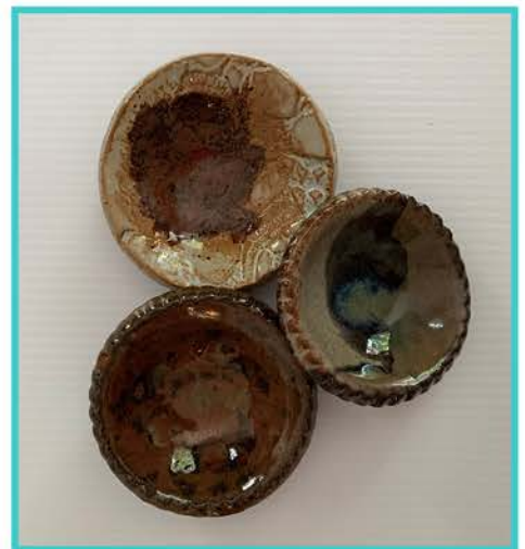
Handmade InReach pottery.