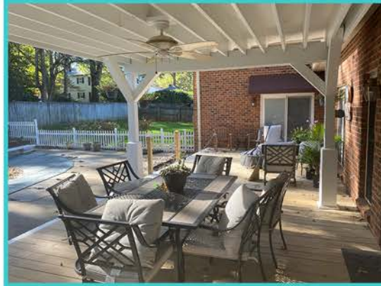
Beautiful back patio.