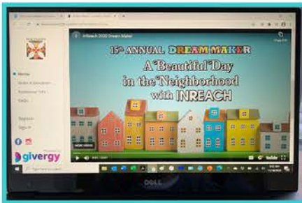
It's a beautiful day in this neighborhood.

“When I was a boy and I would see scary things in the news, my mother would say to me, ‘Look for the helpers. You will always find people who are helping.’” ~ Fred Rogers, of Mr. Rogers Neighborhood