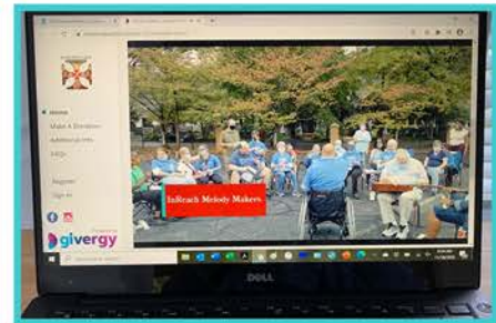
InReach Melody Makers.

Mr. Rogers opening song – “Won’t You Be My Neighbor” – began with the line, “It’s a beautiful day in this neighborhood, a beautiful day for a neighbor. Would you be mine? Could you be mine?” This is the theme of our 15th Annual Dream Maker event, held virtually for the first time. We celebrate throughout the program the joys derived from the friendships our InReach folks have forged with their neighbors, fellow group home residents, and many others. With many presenters of the online program donning red sweaters like our beloved Fred Rogers, viewers of this year’s Dream Maker’s event are treated to an uplifting message reminding all of us of the value in treating everyone with acceptance, understanding and kindness.