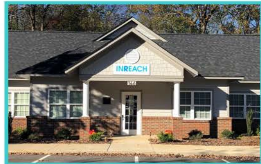
New Day Supports & Activity Center.

Over a year in the making, the building beautifully showcases our day program and incorporates large, open spaces that permit flexibility as well as smaller rooms for private instruction. These specially-designed areas allow for creative arts, recreational classes, and life skills instruction such as group or individualized cooking classes, completing laundry, making a bed, etc. Individuals served here by InReach have access to places to relax or to be a part of the action. The spacious multipurpose room allows for bigger group events and exercise opportunities. Future events will include social opportunities such as dances and game nights.