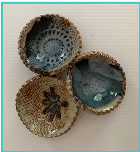
Handmade InReach pottery.