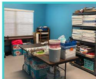
Creative Arts Area